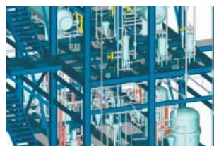
CADworx PLANT 2007 Pipework Modelling for AutoCAD/CAESAR