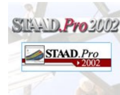
STAAD.Pro 2005 Build 1002 Structural Analysis and Code Checking